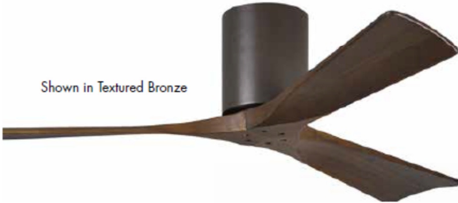
Shown in Textured Bronze