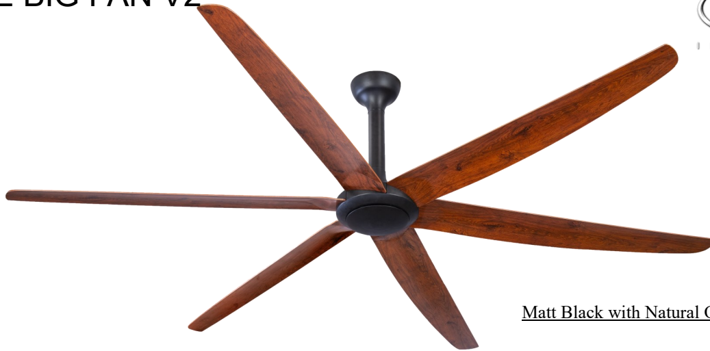
Matt Black with Natural Oak Blade